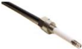
HP Connector For use with HP50-1, HP50-2, HP50- 4 & HP80 Power Units.