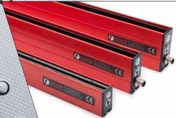
The NEOS Range